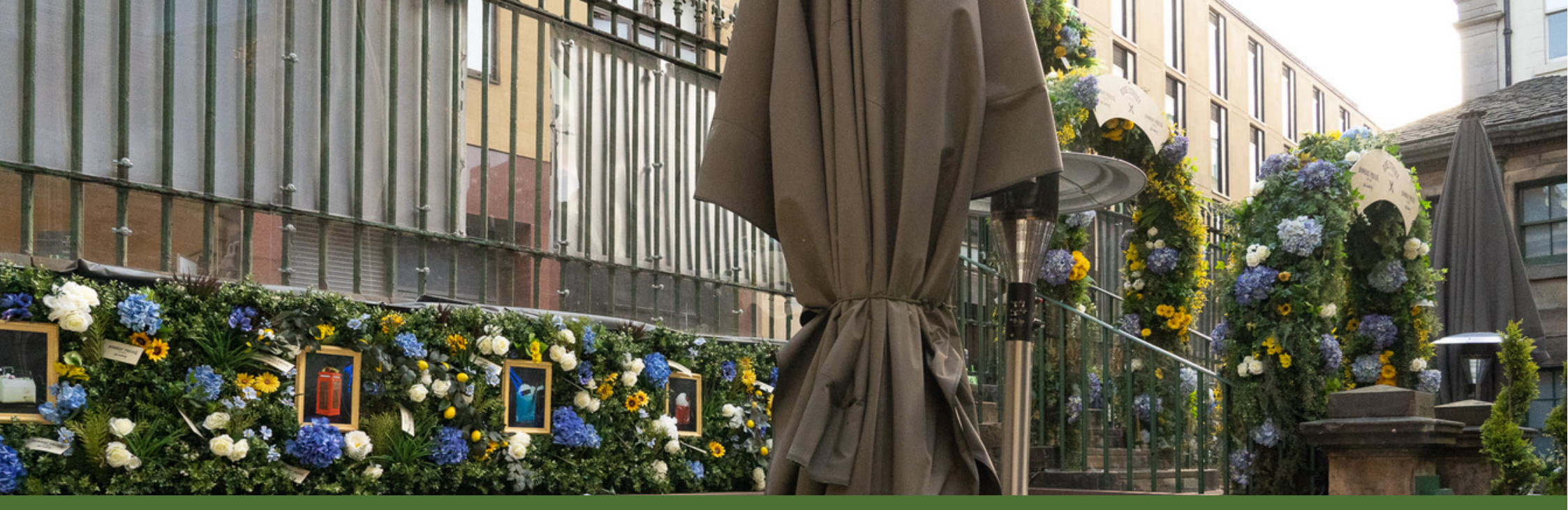
The happiness and well-being of your paying guests is your guarantee of repeat business